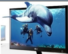
TVs & Audio-Visual NAICS 334310, 334220, 334290