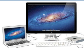
Computers & IT NAICS 423410, 334118, 423430