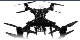
UAV (Drones) NAICS 336411, 334290